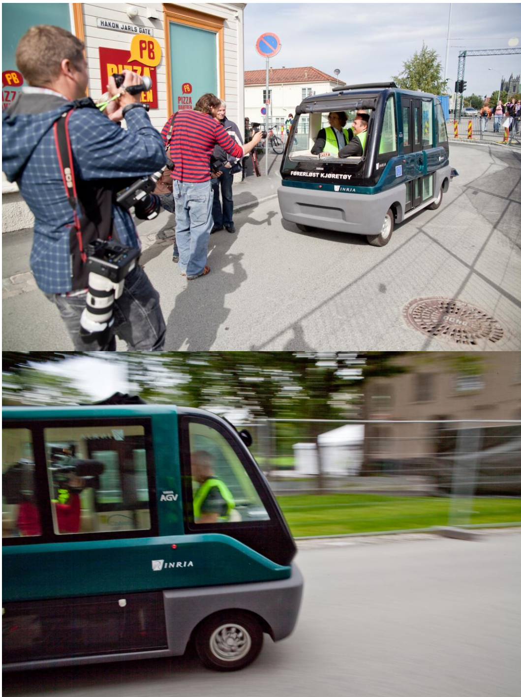
Figure 1. Images of the showcase opening

As mentioned above, an exhibit, designed and produced by the CityNetMobil project, was presented for the second time during the Trondheim showcase. The exhibit represents a “Street of the future”, where all kinds of transportation systems share the public space with pedestrians and cyclists. Seven posters and final version of the video were prepared for this exhibit. Figure 2 shows a 3D view of the exhibit, and Figure 3 shows a picture of the exhibit during the visit of the assistants to the conference A driverless future .